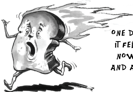
Illustration copyright © 2007 by Judy Love

WHO TOOK A CHANCE AND WROTE A POEM FOR THE I MUST GO DOWN TO THE BEACH AGAIN POETRY CONTEST.