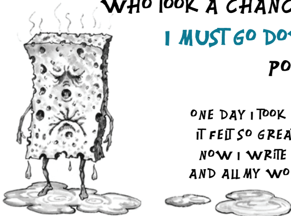
Illustration copyright © 2007 by Judy Love

WHO TOOK A CHANCE AND WROTE A POEM FOR THE I MUST GO DOWN TO THE BEACH AGAIN POETRY CONTEST.